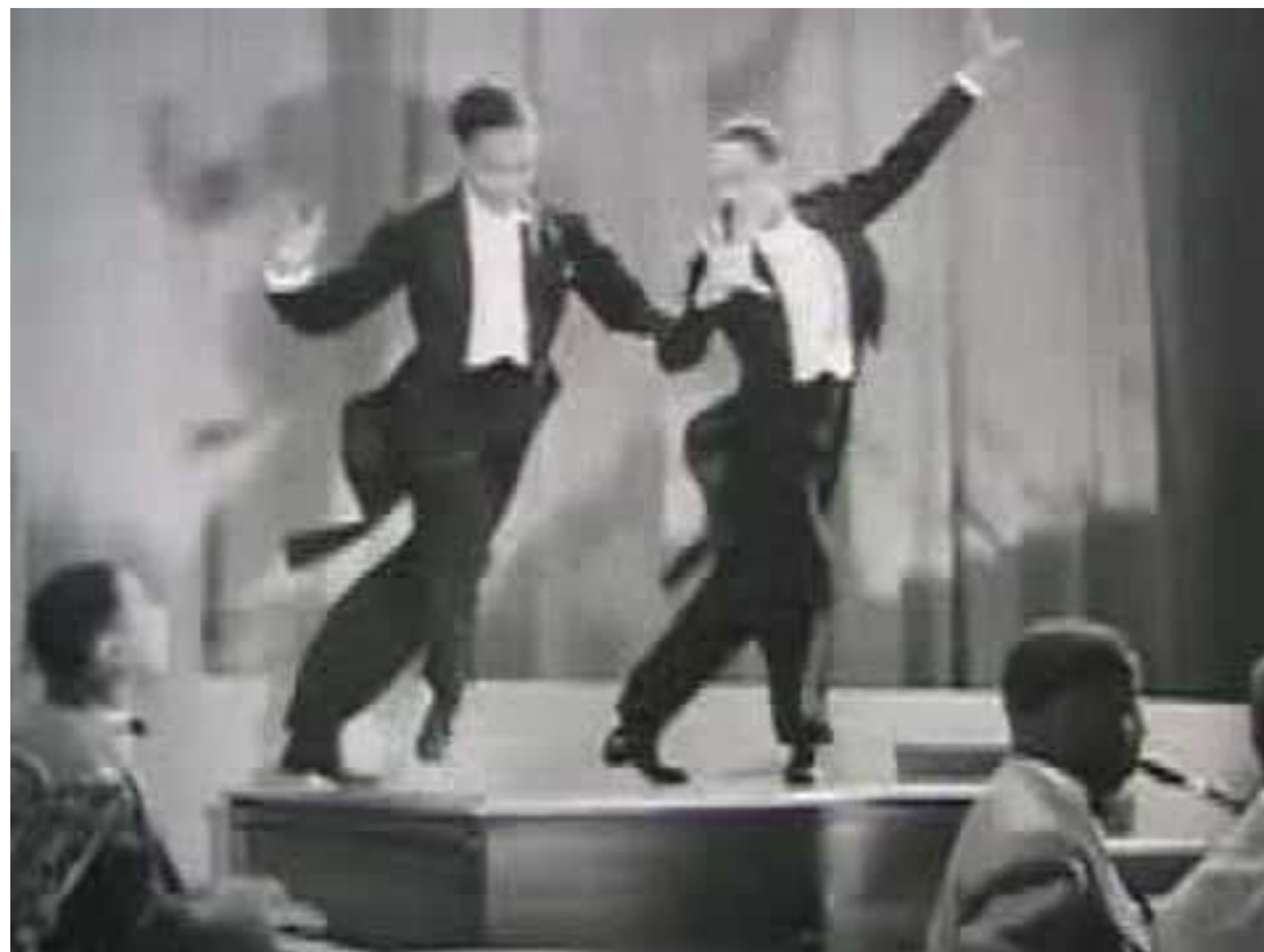
The Nicholas Brothers - Fayard and Harold In 'Stormy Weather'